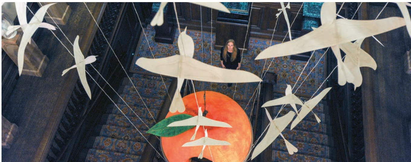
View of installation for James and the Giant Peach , Christmas 2018

The students were introduced to characters, including Beatrix Potter's Peter Rabbit and Jemima Puddle-Duck , and Quentin Blake's illustrations for Roald Dahl's James and the Giant Peach ; all of which featured in Once Upon A Time... Concentrating on use of imagination, lateral thinking and expressing ideas through visual means, the pupils created their own characters. Sessions were designed to promote visual literacy and build creative confidence while developing new skills.