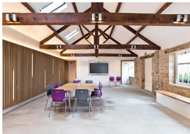
Above The Old Potting Shed before and after, and in use for the Bumble Bee Conservation Trust ( below right )

Looking ahead, The Old Potting Shed will enable us to develop an arts engagement programme for children and adults and also deliver more family learning drop-in sessions over holiday and weekend periods.